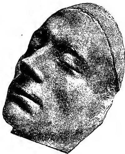
HAYDON'S LIFE-MASK OF KEATS PLACED IN THE POSITION OF SEVERN'S DEATH-BED SKETCH